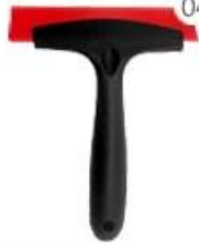
04 Rainbow Scraper