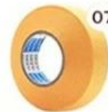
07 Masking Tape