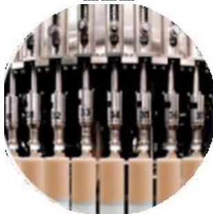
XXXXXXXX XX XXXXXXX XXXXXXX