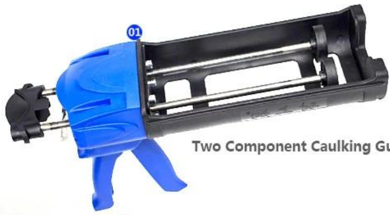
Two Component Caulking Gun