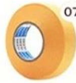
07 Masking Tape