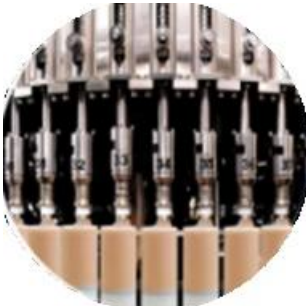
XXXXXXXX XX XXXXXXX XXXXXXX