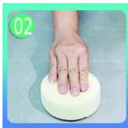
02 用美縫膏浮筒將美縫膏抹平