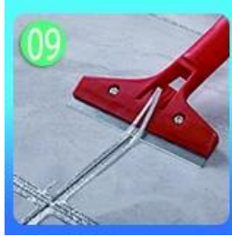
Clean the joint