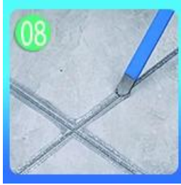
Smooth the grout