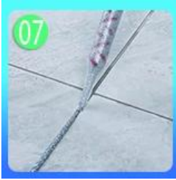
Apply grout to the joint