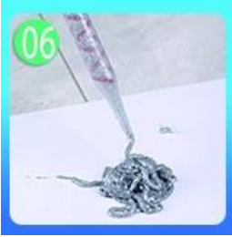
Forepart 60-80 grout