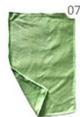
07 Scouring Pad