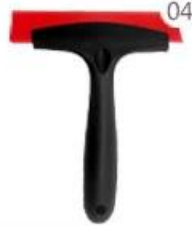
04 Rainbow Scraper