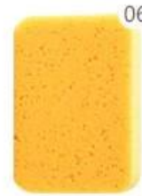
06 The sponge