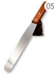
05 Stirring Knife