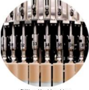
Filling Machine Line