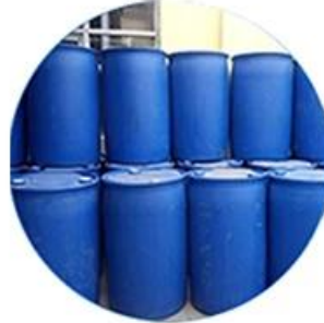
Real Material Stock