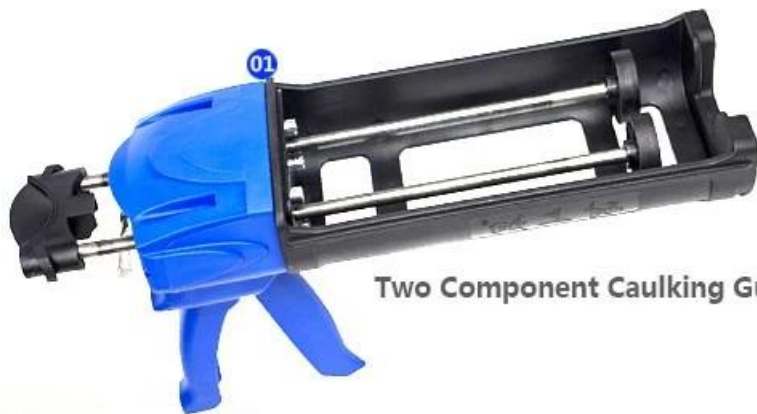
Two Component Caulking Gun