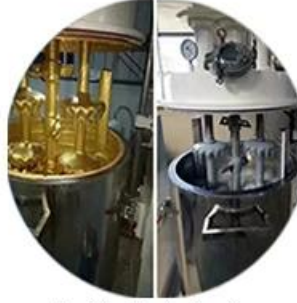
Batching Production Line