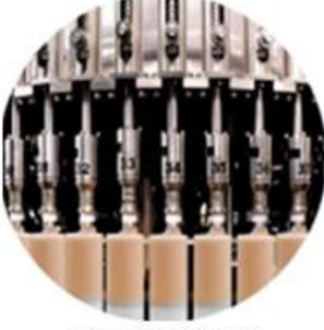
Filling Machine Line