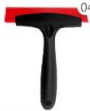
04 Rainbow Scraper