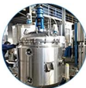
Creaming Machine Line